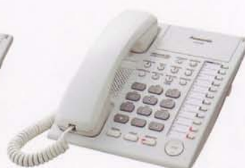
■ KX-T7750 Monitor Unit