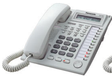
■ KX-T7730 Speakerphone Unit