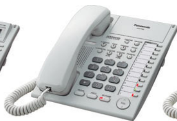
■ KX-T7720 Speakerphone Unit