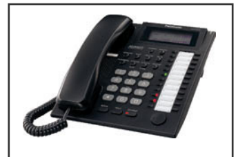
Units available in Black and White