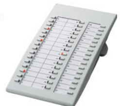
■ KX-T7740 DSS Console